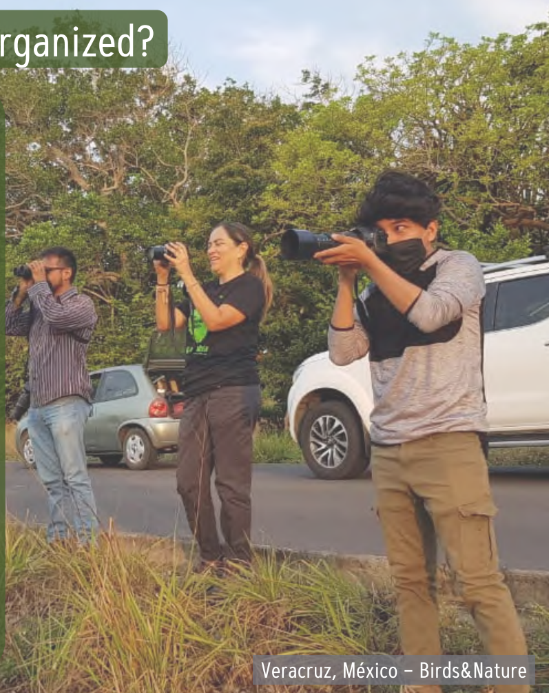
Veracruz, México – Birds&Nature

While the City Nature Challenge is coordinated by the Community Science teams at the Natural History Museum of Los Angeles County (NHM) and the California Academy of Sciences (CAS), the success of the CNC is really due to the local organizers. Every official CNC city or metro area has a person or multiple people from that region who have taken on the role as local organizer, often times as part of their job in an organization that is mission-aligned with the goals for the CNC, but many organizers also volunteer their time. NHMLAC and CAS start meeting regularly with organizers six months prior to the CNC, and provide support, training, and tools, and the local organizers then promote and implement the CNC in the ways that work best in their communities. Many organizers have formed local partnerships with organizations such as city/regional governments, parks departments, science/nature centers, scouts, schools and universities, and nature groups to help spread the word, organize local events, and build community for the City Nature Challenge.